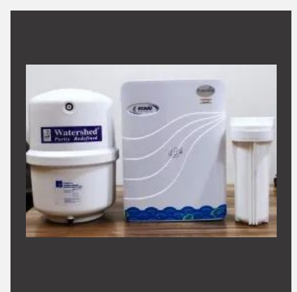
UTC - OCEAN (Under the Counter