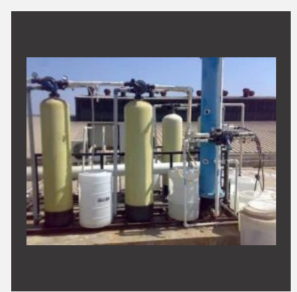
Dm Water Plant