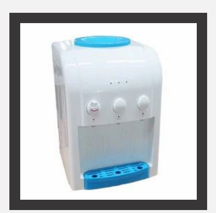
Drinking Water Dispenser