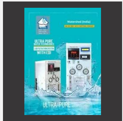
Ultra Pure Water with EDI