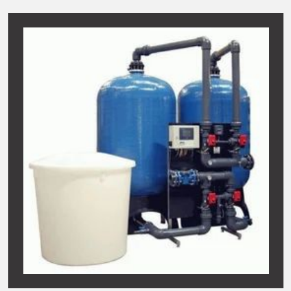
Hard Water Softener for Hotels