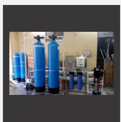
1000LPH Industrial RO System Plant