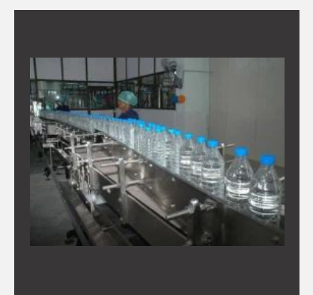
Packaged Drinking Mineral Water Plant