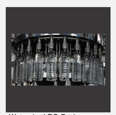
Watershed RO Package Drinking Water Projects