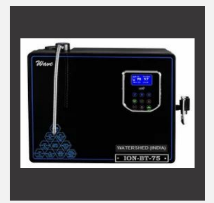
Ionizer with Inbuilt Water Purifier