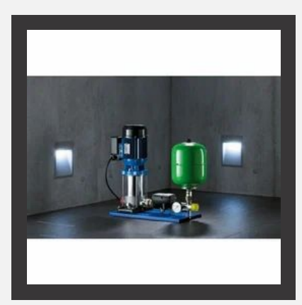
Hydro-Pneumatic Water Booster Pumps