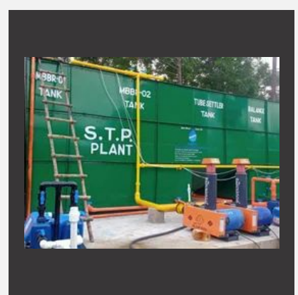
Commercial Sewage Treatment Plant