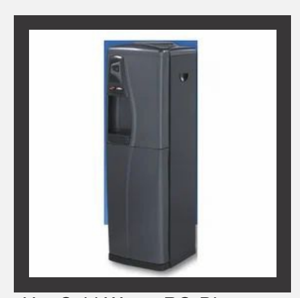
Hot Cold Water RO Dispenser