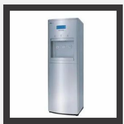
Cold Water Dispenser RO System