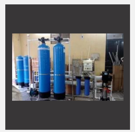
1000 Lph Ro Plant