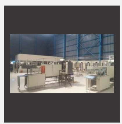
Turnkey Packaged Drinking Water Projects