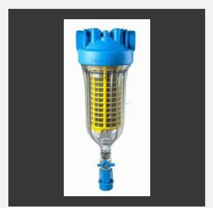
Hydra Water Sediment Filter -Self Cleaning Type