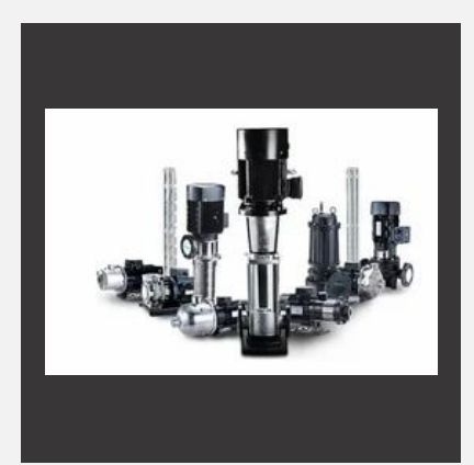
Vertical & Horizontal Multistage Centrifugal Pumps