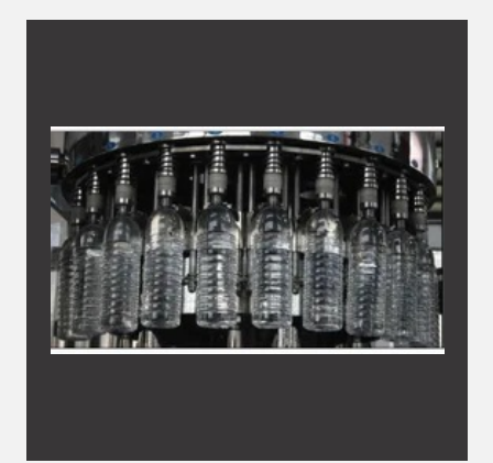
Packaged Drinking Water Plant