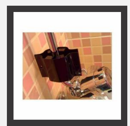
Magnetic Water Conditioner (Magna Guard)