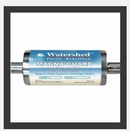
Magnetic Water Conditioner System