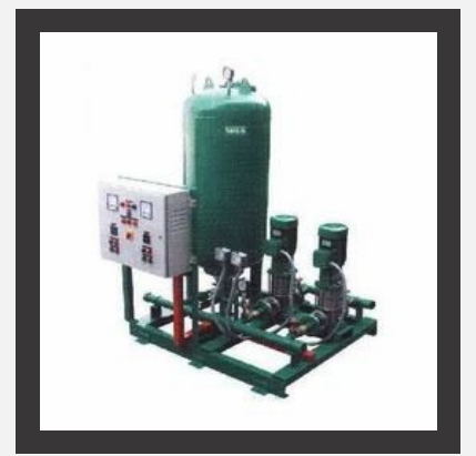
Hydro Pneumatic System