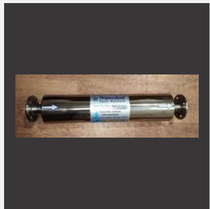
Magna Guard Water Conditioner