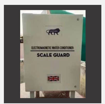
Electronic Water Conditioner