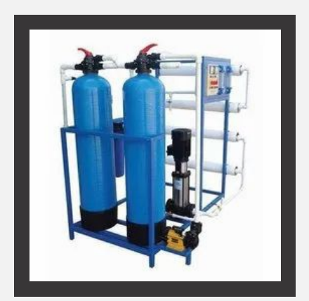
Water Purification Systems