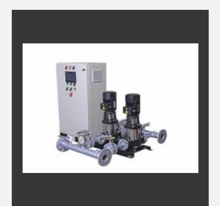
DRL - V Series with VFD Panel