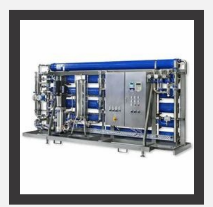
Reverse Osmosis Plants