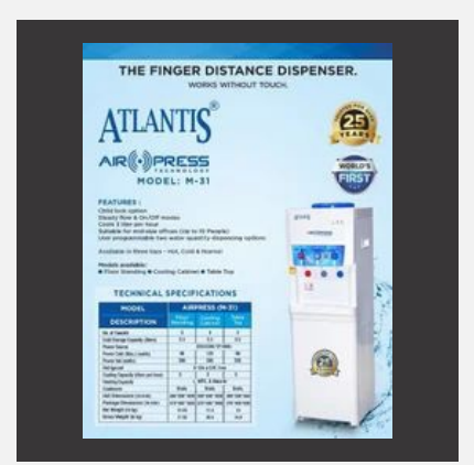
Atlantis Water Dispenser