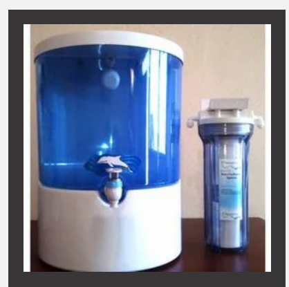
Household RO Water Purifier