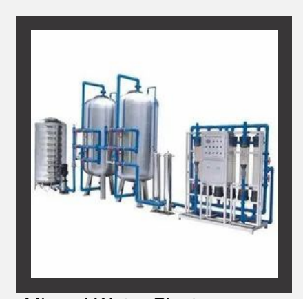
Mineral Water Plant