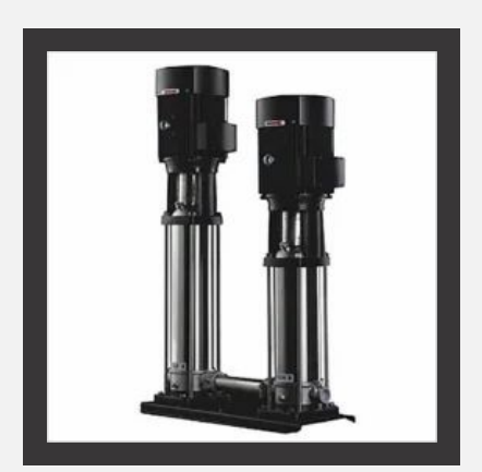
High Pressure Booster Pump