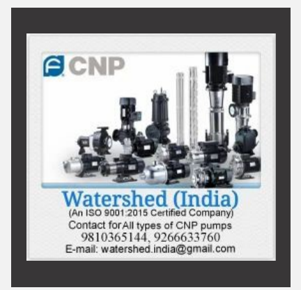
CNP Horizontal and Vertical Multistage Centrifugal Pump