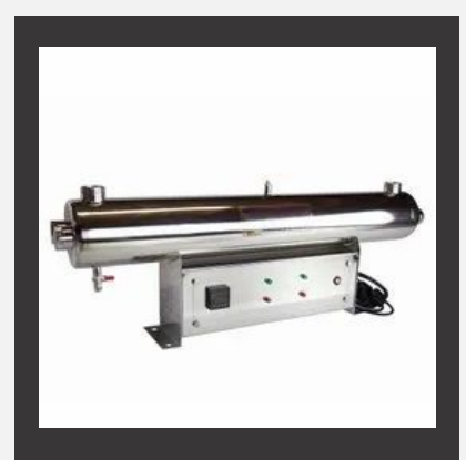
Commercial UV Sterilizers