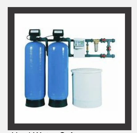
Hard Water Softener