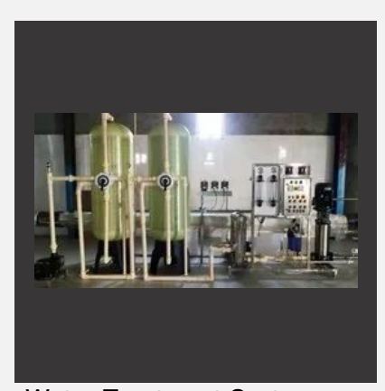
Water Treatment Systems