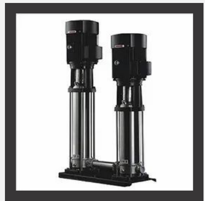
Vertical Multistage Centrifugal Pump