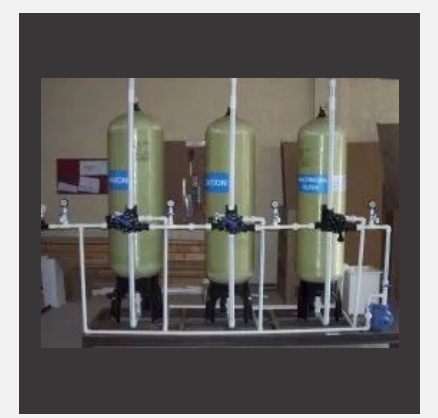
De-Mineralization Water Treatment Plants