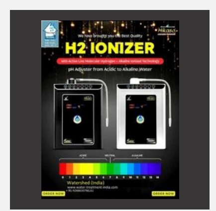
H2 IONIZER Machines