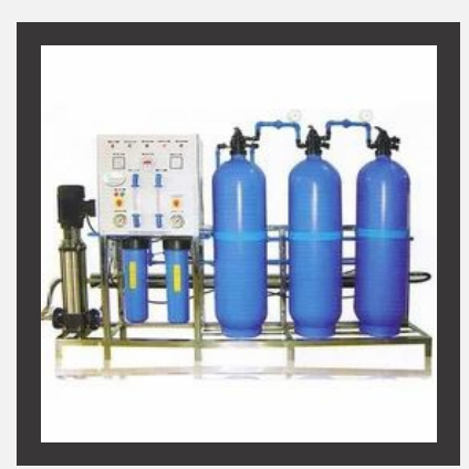
Superior Water Conditioning