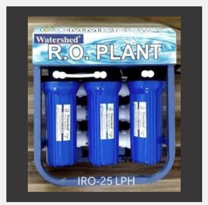
25 Lph Commercial Ro Plant