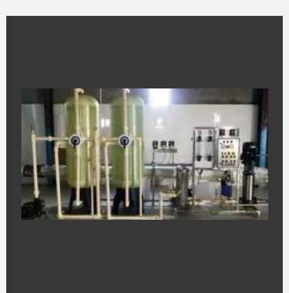
Commercial RO Plants