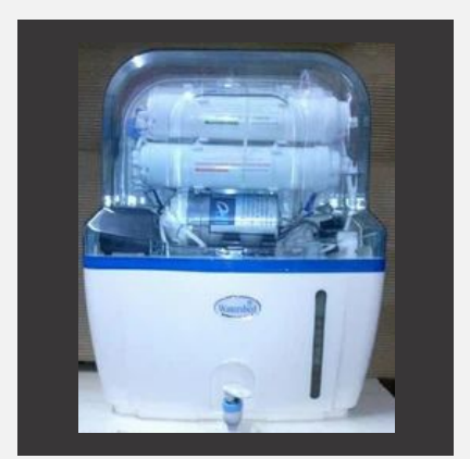
Swift RO System