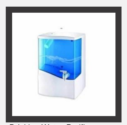
Drinking Water Purifier