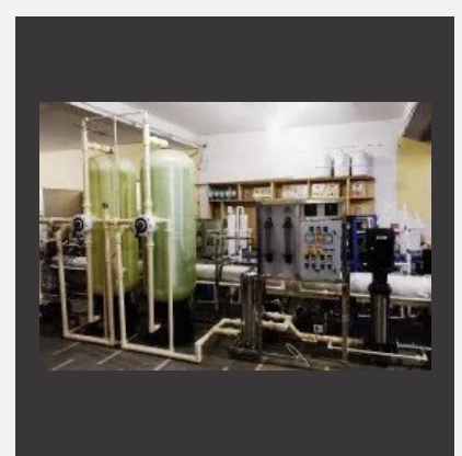
Industrial Water Purifier