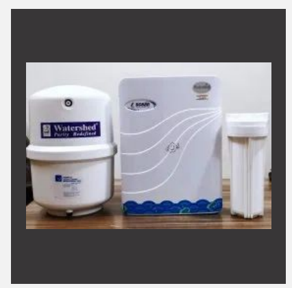
Pure RO System Filters