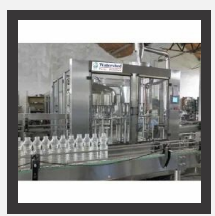
Packaged Drinking Water Machine