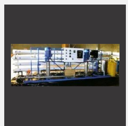
Industrial Reverse Osmosis Plants