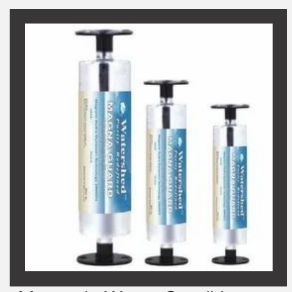
Magnetic Water Conditioner