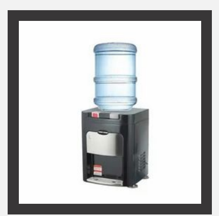
Table Top Water Dispenser