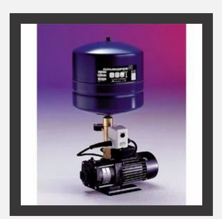
Pressure Booster Pump