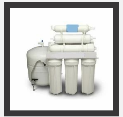
Optima RO System with Tank