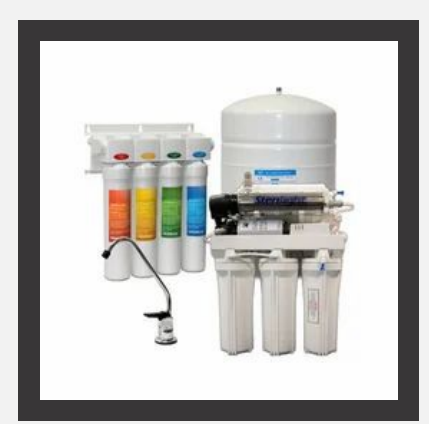
Household RO System