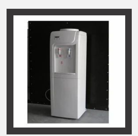
Water Dispenser with Built in RO System