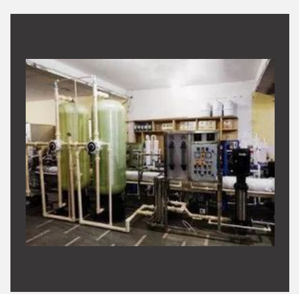
Industrial RO System